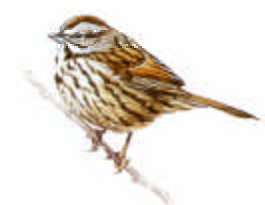
Song Sparrow