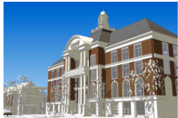
Above: an architect's rendering of the proposed Krispy Kreme headquarters. Below right: The master plan for Unity Place.

Great things are in store for the West End! On January 23 rd , Krispy Kreme, the NC School of the Arts, the City of Winston-Salem and other participants announced the details of a proposed $87 million development for the area between Broad Street, Fourth Street and Brookstown, to be known as Unity Place. The developers plan to begin construction in late 2003, with occupancy by Krispy Kreme in early 2005. The film theatre complex is expected to be completed in early 2005, and the Performing Arts Center in mid to late 2005. Of proximity to the West End, a Krispy Kreme spokesperson says, "We look forward to being neighbors!"